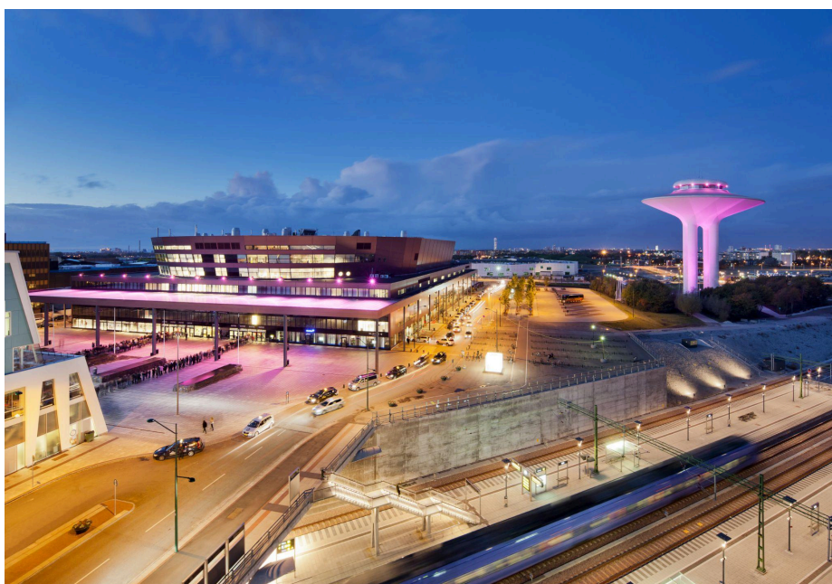
Malmö Arena.

The Arena has been the home of the Malmö Redhawks ice hockey team since 2008, and has also hosted concerts from international headliners like Lady Gaga, Britney Spears, Rihanna, Bob Dylan, and Eurovision royalty Cliff Richard. Malmö Arena has a maximum possible concert capacity of 15,500, but with this year's ambitious stage design (a nearly 360-degree cross-shaped thrust stage), the number of tickets available will be significantly below that number.